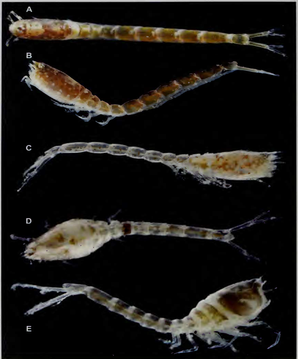
Figure 3.- A-C. Iphinoe canariensis Corbera, Brito & Núñez, 2002: adult male from Tenerife (A-B) and preadult female from Gran Canaria (C); D-E. Speleocuma guanche Corbera, 2002: individual from Lanzarote (D) and preadult female from Tenerife (E).